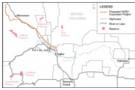
Pembina Pipeline open house to be held June 9