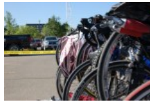
Blizzard Bike Club duathlon series comes to close