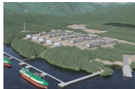
B.C. LNG Alliance says enough gas exists to support large exports