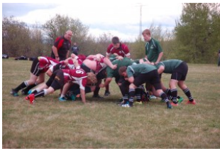
NPSS boys and girls rugby teams each take third place as season concludes