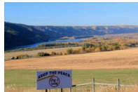
BC Hydro refutes PVLA claims against Site C