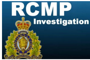
Northern Rockies RCMP respond to shooting