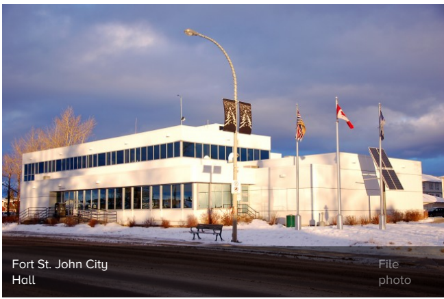
Fort St. John City Hall

Backcountry - Helping You Enjoy The Great Outdoors